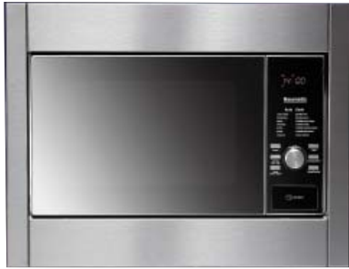
BTM23.2M 23 Litre Microwave Oven & Grill with Mirror Door Finish 900W With 6 Power Levels 14 Preset Programmes