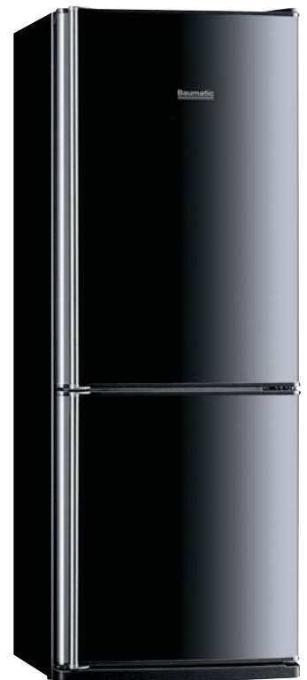
BF340BL 316 Litre Black Fridge Freezer A energy Frost Free - Never Have to Defrost!