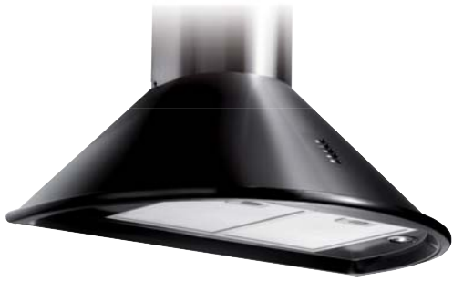
BTC9530BL 90cm Curved Black Chimney Hood 500m 3 /hr High Extraction Rate