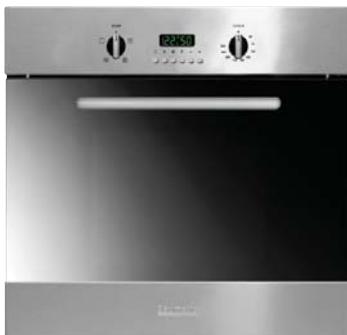
B152SS 60cm Stainless Steel Single Fan Oven 4 Oven Functions Full LED Programmer A Energy