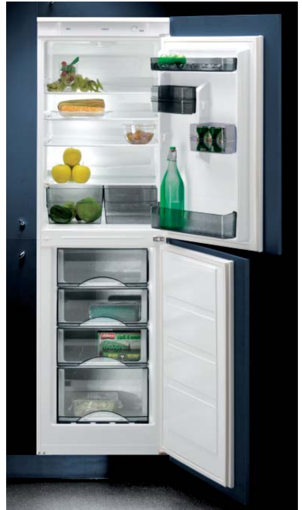
BR27B Integrated Combi Fridge Freezer Frost Free - Never Have to Defrost!