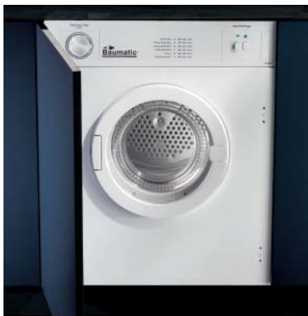
BTD1 Integrated Vented Tumble Dryer 6 kg Capacity 6 Programmes 2 Heat Settings