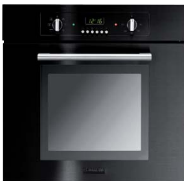
B501BS 60cm Black Steel Single Multifunction Oven 7 Oven Functions Full LED Programmer A Energy