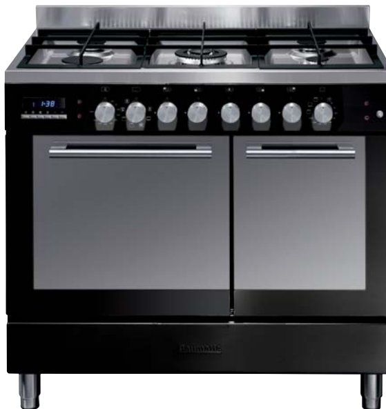
PCC9220BL 90cm Dual Fuel Twin Cavity Range Cooker 5 Gas Burners Including Wok Multifunction Main Oven