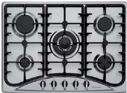
B68SS 70cm Stainless Steel Gas Hob 5 Burners Including Triple Crown Wok Burner Auto Ignition Fits Standard 60cm Cut-out