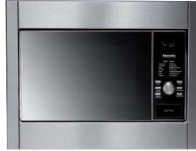
BTM25.2M 25 Litre Combi Microwave Oven 5 Oven Functions Including Combi Fan & Microwave for Speedy Cooking Results