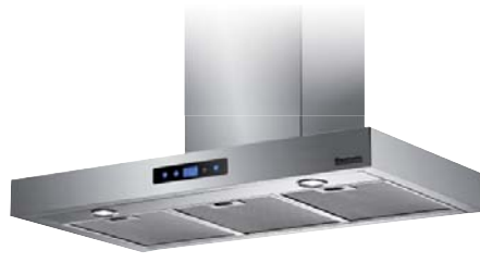
BTC6740SS / BTC9740SS 60cm / 90cm Stainless Steel Chimney Hood LCD Display 750m 3 /hr Superior Extraction Rate