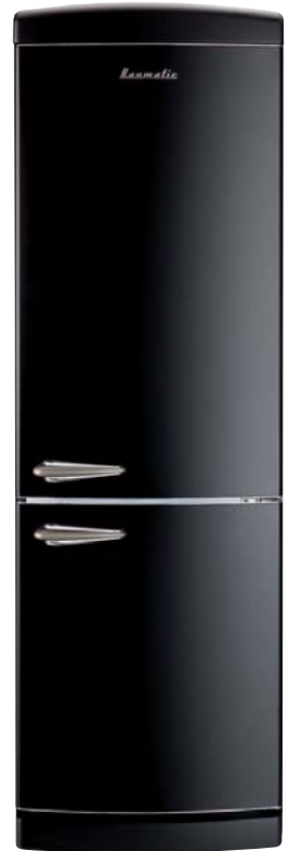
RETRO4BL 301 Litre Black Retro Style Fridge Freezer A+ energy Glass Shelves