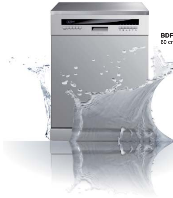
BDF671SS 60 cm Electronic Dishwasher

If you are as concerned about the environment as we are, then the Baumatic BDF671SS or BDS670SS dishwasher is for you. Featuring Baumatic's new auto sensing technology, this dishwasher will sense how dirty your dishes are and adjust the energy, water and time to suit. The end result is perfectly washed dishes, every time using the minimal amount of water, energy and time, saving you money and the environment. The BDF671SS features 14 place settings for the largest of loads, and both models can be operated to wash a half load with our convenient half load feature. The new electronic display gives you information about each wash, when you select through the 7 wash programmes available, but best of all these dishwashers tell you the remaining time left as the wash progresses.