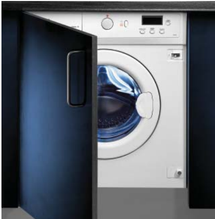
BTWM5 Integrated Washing Machine 6 kg Capacity 1100 rpm Spin Speed A Energy A Wash Performance