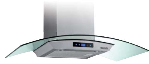
BTC6750GL / BTC9750GL 60cm / 90cm Stainless Steel Chimney Hood with Glass Canopy LCD Display 750m 3 /hr Superior Extraction Rate