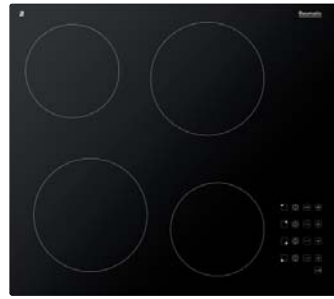
BHC600 60cm Ceramic Hob 4 Hyper-speed Fast Zones Touch Controls Frameless