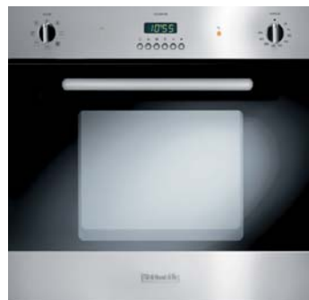
B155.1SS-A 60cm Stainless Steel Single Multifunction Oven 7 Oven Functions Full LED Programmer A Energy