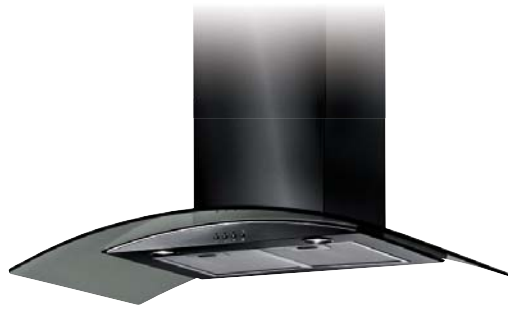
BT9.3BGL 90cm Black Chimney Hood with Glass Canopy 500m 3 /hr High Extraction Rate