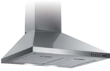
BTC6720SS 60cm Stainless Steel Chimney Hood 750m 3 /hr Superior Extraction Rate